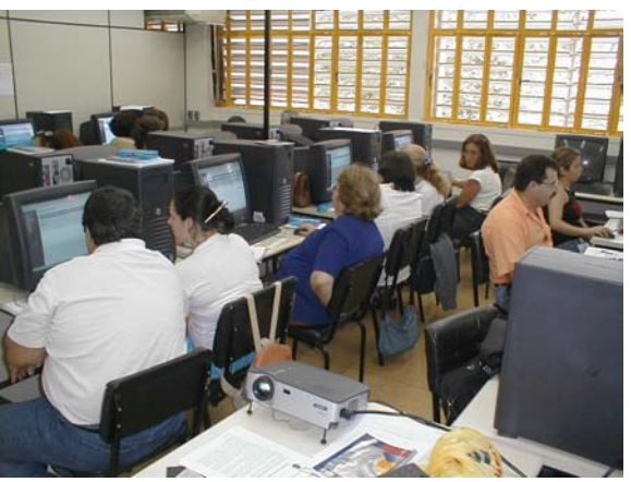
Figure 3 - Theoretical class